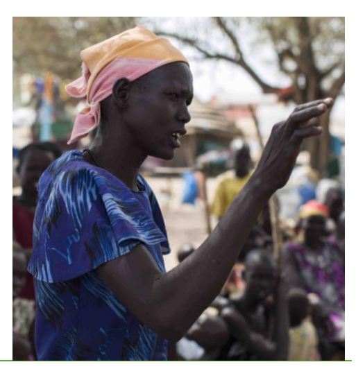
Clockwise from left: teaching women literacy and political rights in Yemen; a policewoman in Afghanistan; a villager addressing an Oxfam public health meeting in South Sudan; a Syrian refugee in Lebanon; discussing local peace issues in South Sudan. Credits on back page.