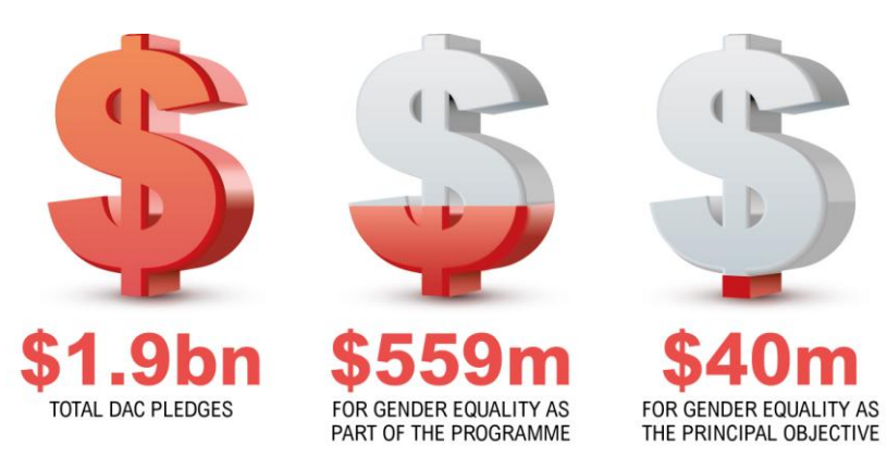
Figure 2: Funding pledged by DAC donors for peace and security programming in fragile states, 2012 and 2013